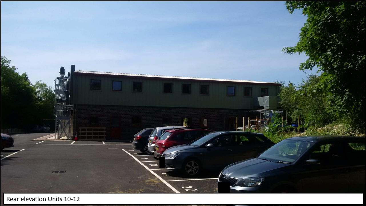
Rear elevation Units 10-12