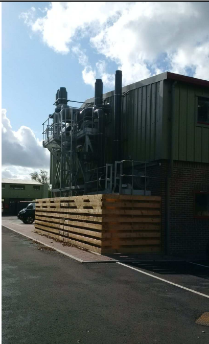
Extract fans and enclosure to side elevation