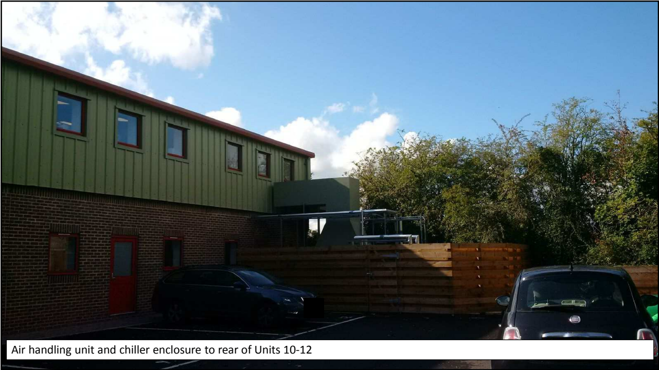
Air handling unit and chiller enclosure to rear of Units 10-12