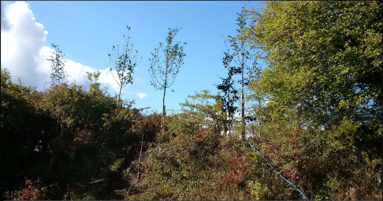
Part of the planting along the boundary